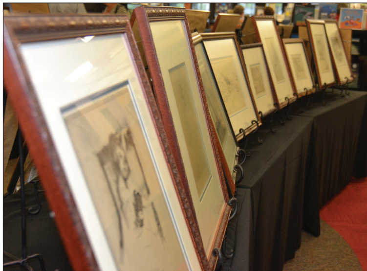
Seen in the foreground is Mary Cassatt's "Portrait" (Kneeling in An Arm-chair), ca. 1903, one of the works that make up the Library's McCurdy Collection. Forty pieces of the collection will be on display in the Community Room from 9am-2pm on Saturday, May 7, as part of the Area Arts Showcase.