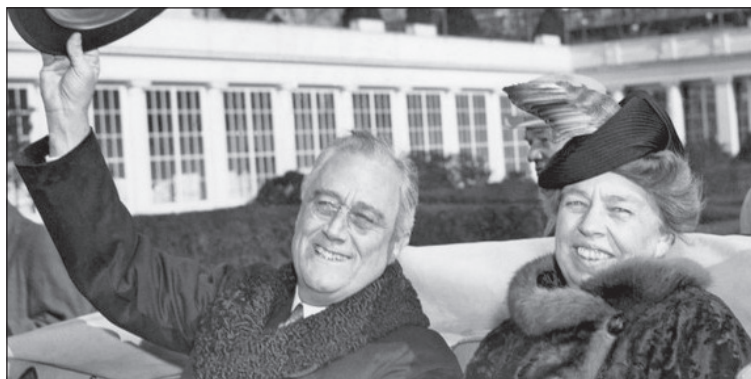
Franklin and Eleanor Roosevelt will each be the subject of their own Library program during the month of May.